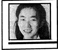
Along the way By BRENDA LING Times Staff Writer

In the 1940s and 1950s, parts of the land were sold because the property was too valuable to keep as a farm, Braun said.